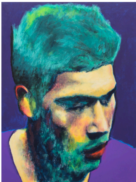
Nadjib Ben Ali, CCTVision, 2024.

The artist takes screenshots of soccer matches on his laptop or smartphone, building up a library of images. He then uses a singular technique to transcribe the shimmering aspect of these screenshots: Hot glue sticks wrapped in synthetic fabric are dipped in acrylic pigments to create paint pencils. This process culminates in his trademark touch, which resembles strokes of fluorescent felt-tip pen in pink, yellow, purple, or green.