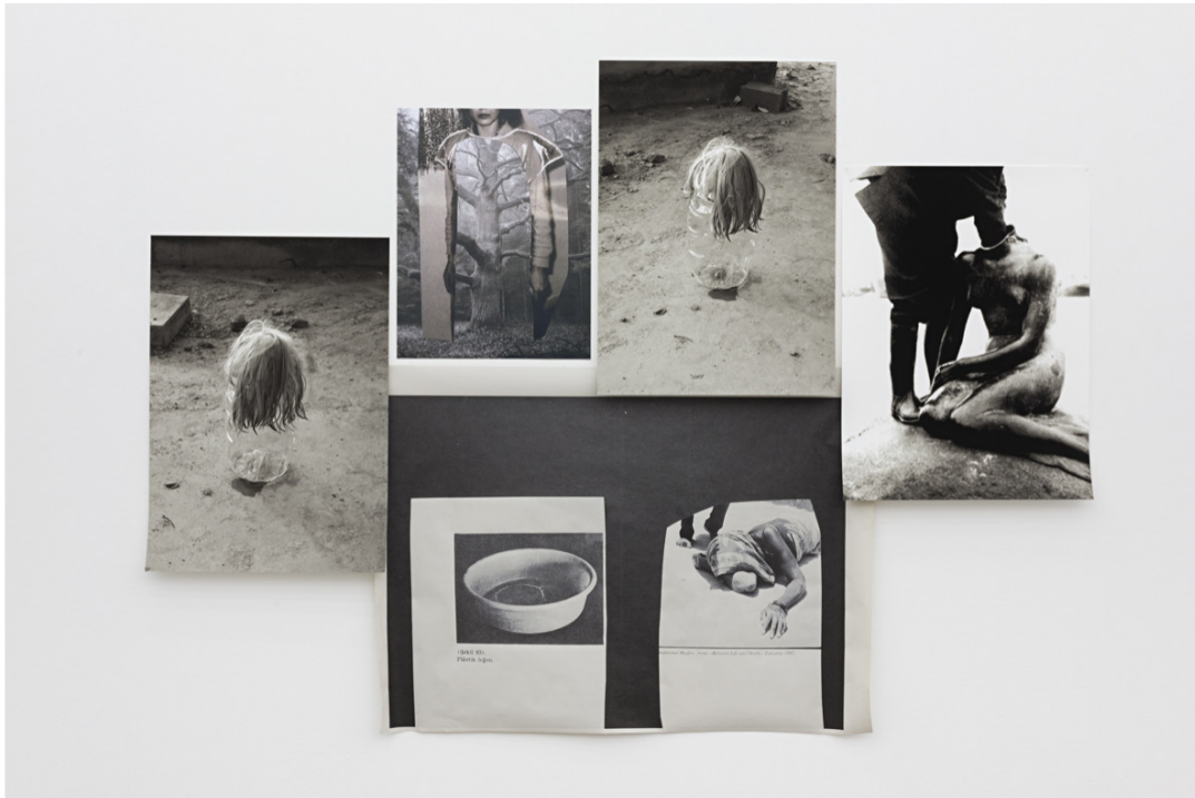
Özlem Altin. Container (corporeality, objects and affects) . 2017