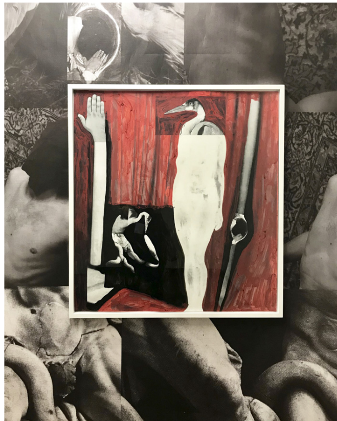
Özlem Altin. Portal (Highpriestess) . 2019