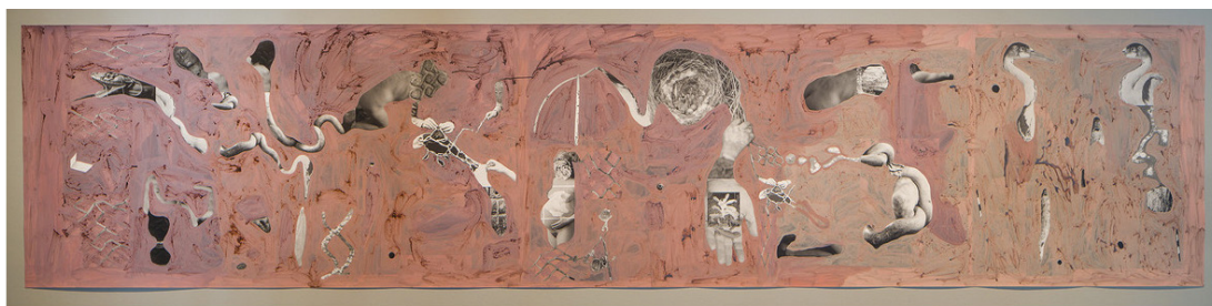
Özlem Altın. Topography (of time, of body) . 2019

The mural-scaled Topography (of time, of body) (2019) is a map of similarly disparate images that have been linked together, like distant towns connected by roads. The overall pink hue of the work also resembles fleshy tissue, with veins flowing through it, bringing life from one organ to another. The physicality of Altın's materials—the unframed canvas, layered with ink—underscores that reading. To create the work, Altın printed her montage of images as one photographic print, and then painted directly onto it, covering over much of the imagery to isolate certain elements. Though she highlights particular components, she is also interested in the spaces between them, a relationship made visible in the emblem of hands at work, knitting together strands of material. Altın feels that Topography (of time, of body) invites viewers to enter in, drawn not only to the figures but to their change and growth—the “process of becoming.”