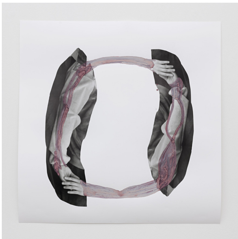
Özlem Altın. Wheel of Union . 2017