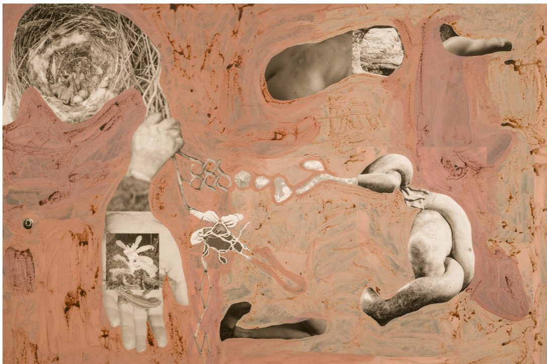
Özlem Altın. Topography (of time, of body) (detail). 2019