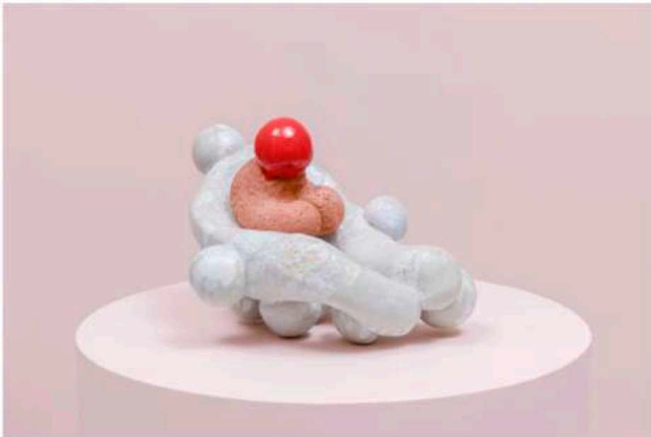
CLOWNESSES DUO 3 GLAZED CERAMIC 26 x 43 x 30 CM 2020