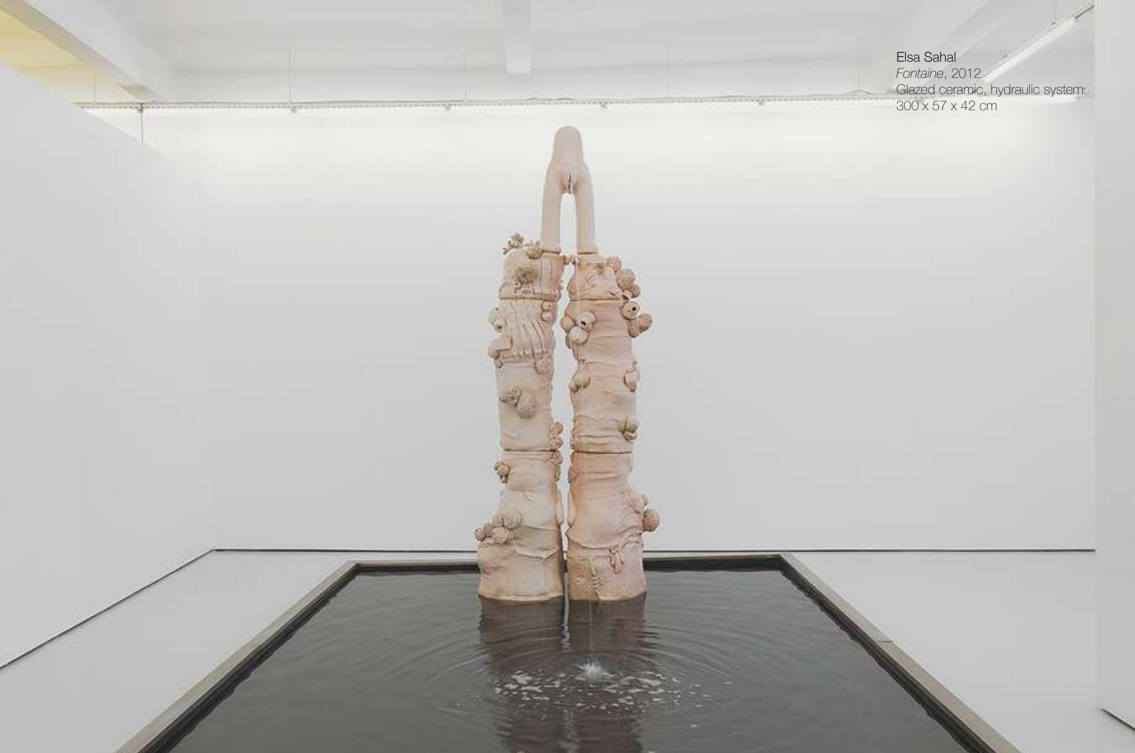
Elsa Sahal Fontaine , 2012 Glazed ceramic, hydraulic system 300 x 57 x 42 cm