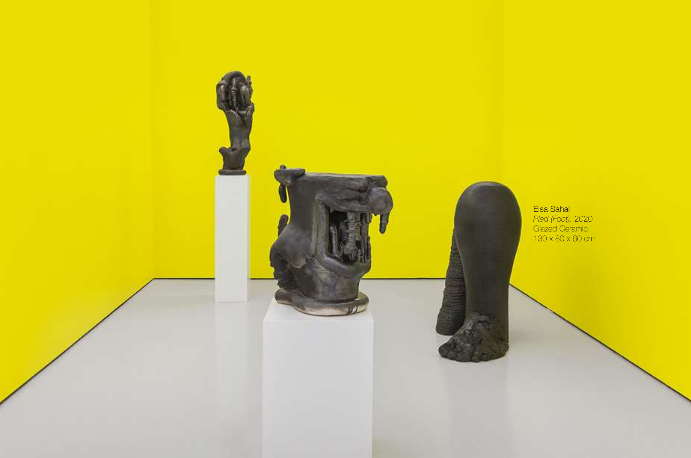
Elsa Sahal Pied (Foot) , 2020 Glazed Ceramic 130 x 80 x 60 cm