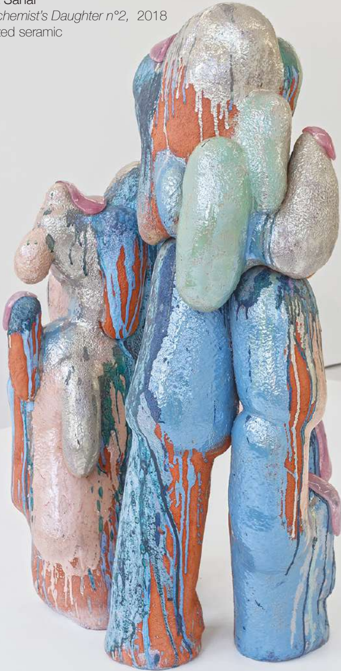
Elsa Sahal CAchemist's Daughter n°2 , 2018 Glazed ceramic