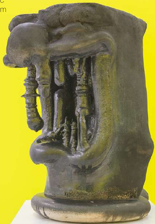
Elsa Sahal Nichonesque 2 , 2020 Glazed Ceramic 65 x 73 x 64 cm