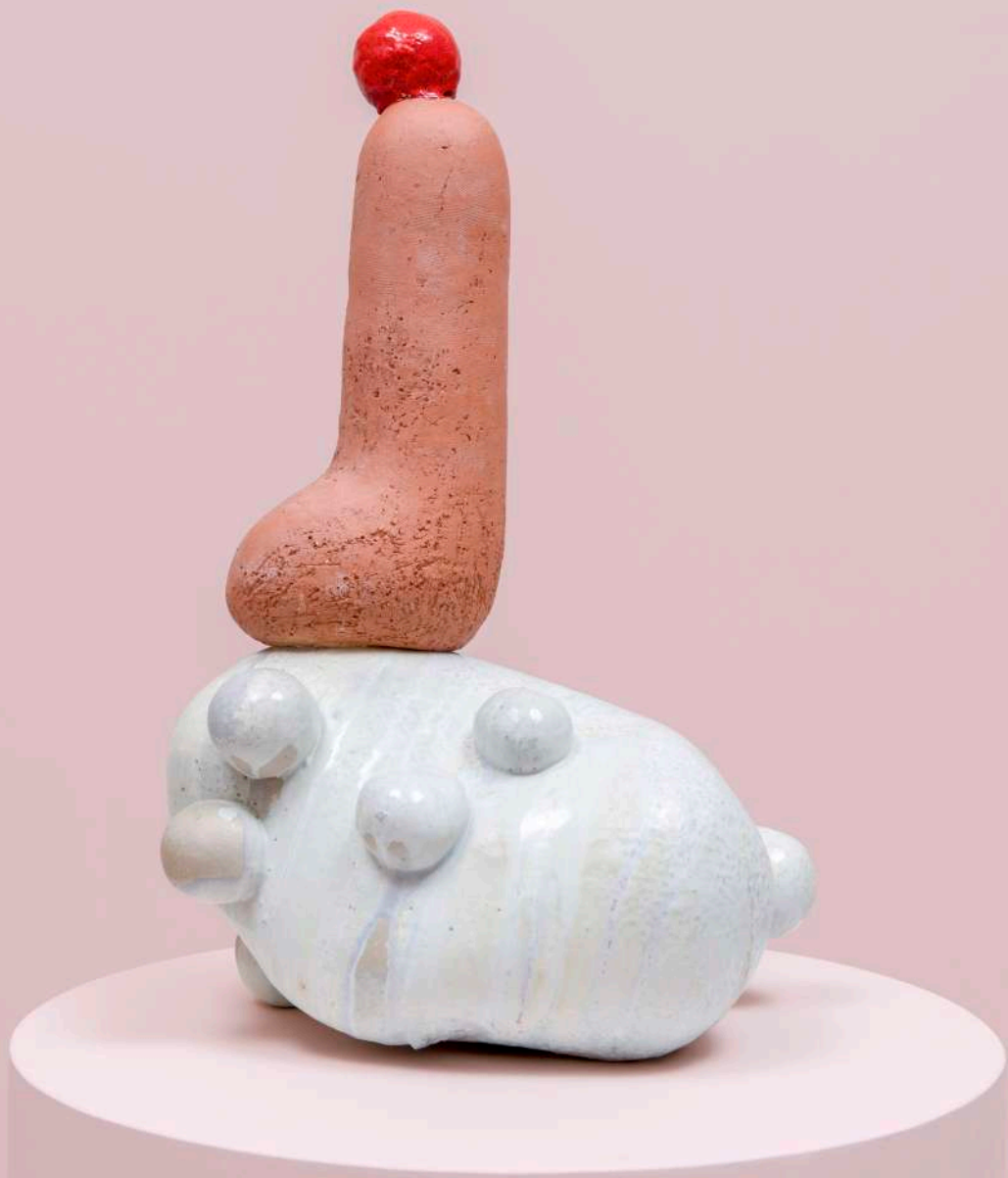
Elsa Sahal Clownesses duo 2 , 2020 Glazed Ceramic 63 x 44 x 36 cm