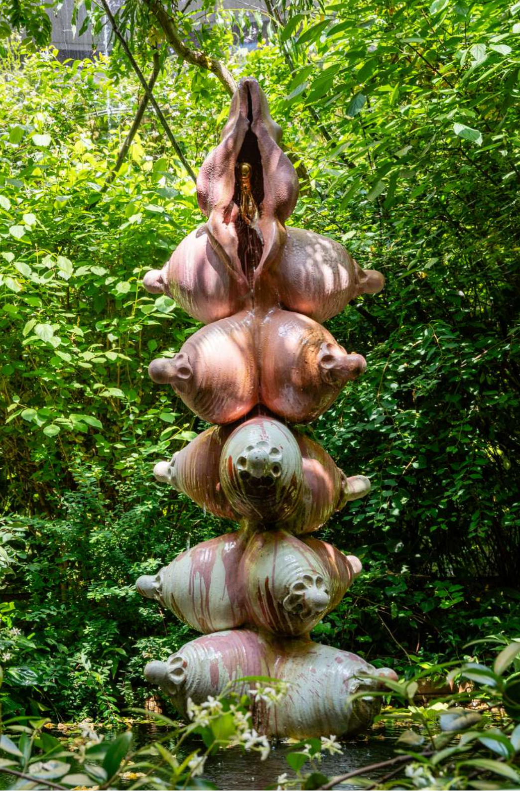
Elsa Sahal Vénus polymathe jouissante , 2019 Enamelled ceramics