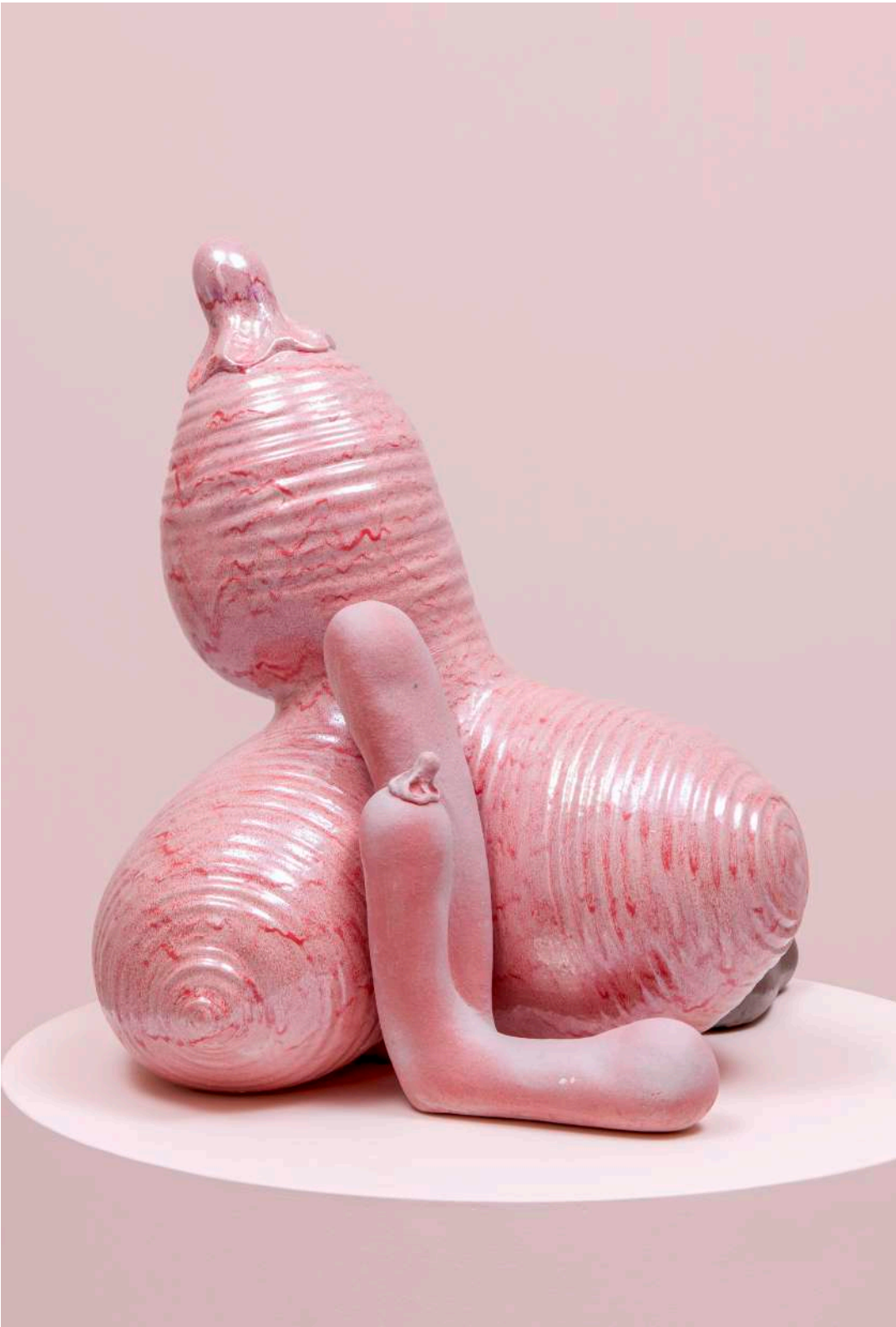
Elsa Sahal Nichonesque 2 , 2020 Glazed Ceramic 65 x 73 x 64 cm